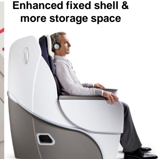
Enhanced fixed shell & more storage space