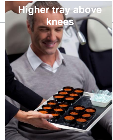
Higher tray above knees