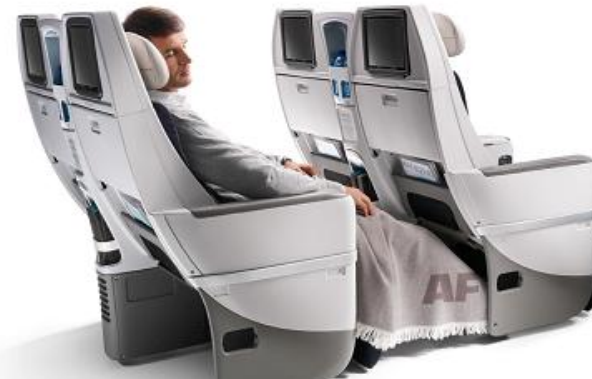
Premium Voyageur: 40% more space than Economy