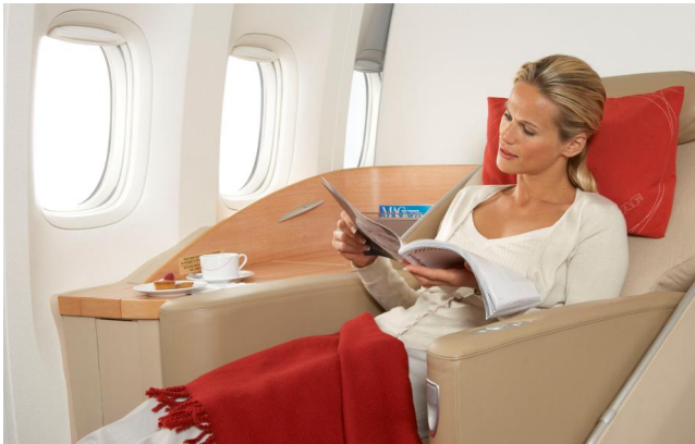
La Première (First Class): Luxury & Personal Attention