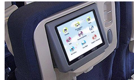
Voyageur (Economy Class): Value with amenities

Individual video on-demand entertainment in all cabins on long-haul international flights