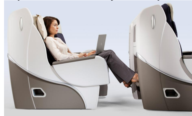
Improved Connectivity: USB & power