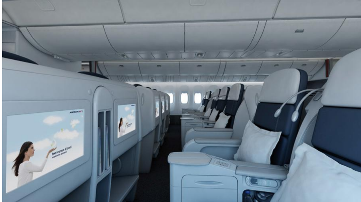
New Subdued Cabin Ambience