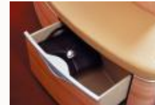
Ottoman bench with storage drawers