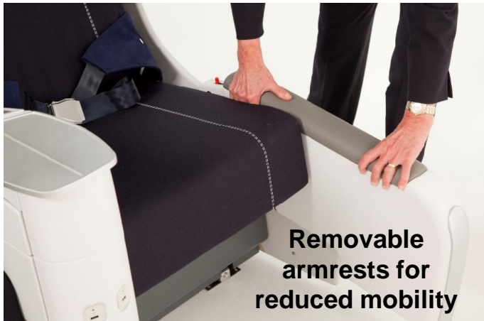
Removable armrests for reduced mobility passengers