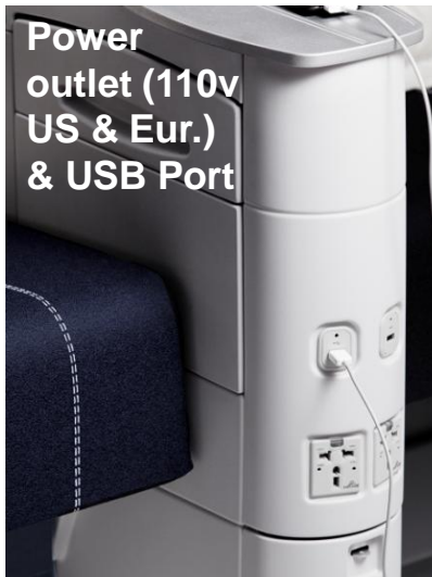
Power outlet (110v US & Eur.) & USB Port