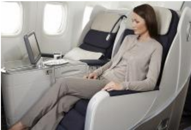
Affaires (Business Class): Comfort & Convenience with lie-flat seats