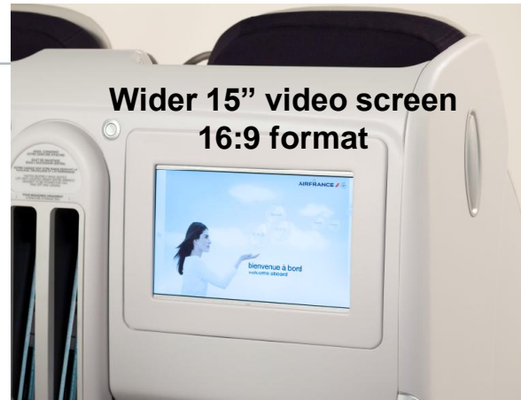
Wider 15" video screen 16:9 format