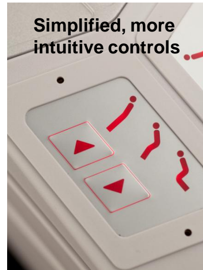
Simplified, more intuitive controls