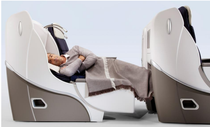
Improved lie-flat seat